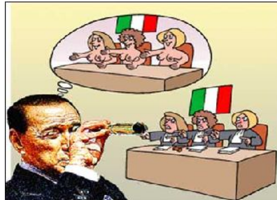
Berlusconi and 3 female judges